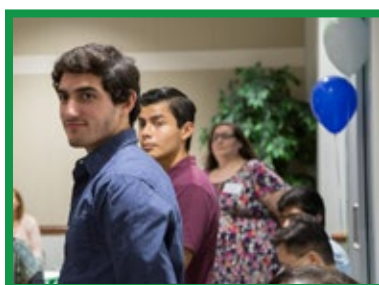
Proud scholarship recipients stand for recognition

The Foundation hosted an event on February 23 to honor donors and scholarship recipients from the 2016-2017 academic year. The event was held at the Public Safety Institute on the Melbourne Campus. Students had the opportunity to meet their donors and thank them for their generosity. It was a rewarding evening for all involved. A full story and photos can be found at: easternflorida.edu/news-events/news-releases/2017/02-23-titan-scholarships-reception.cfm