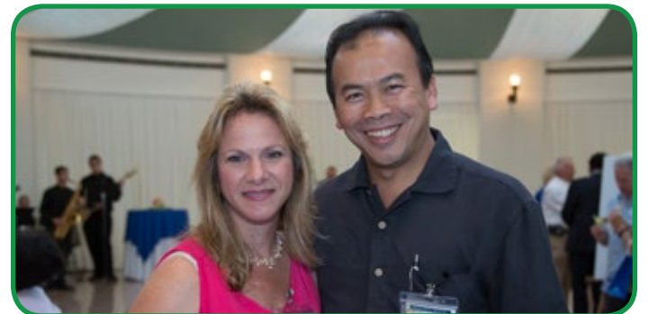
Alumni enjoy the evening