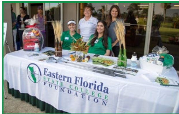
Foundation employees and volunteers greet our golfers with big smiles.