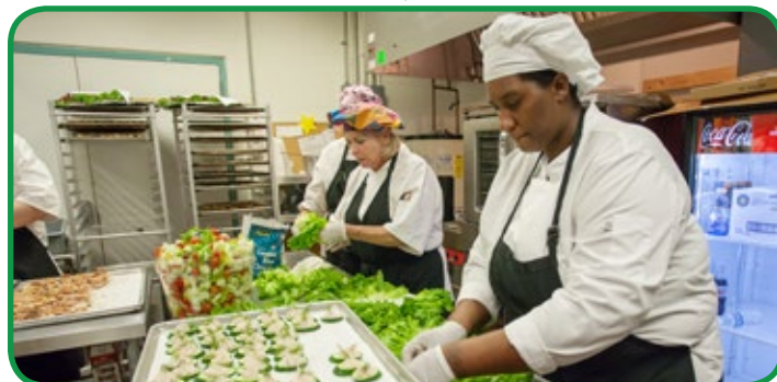
Culinary Students prepare tasty treats